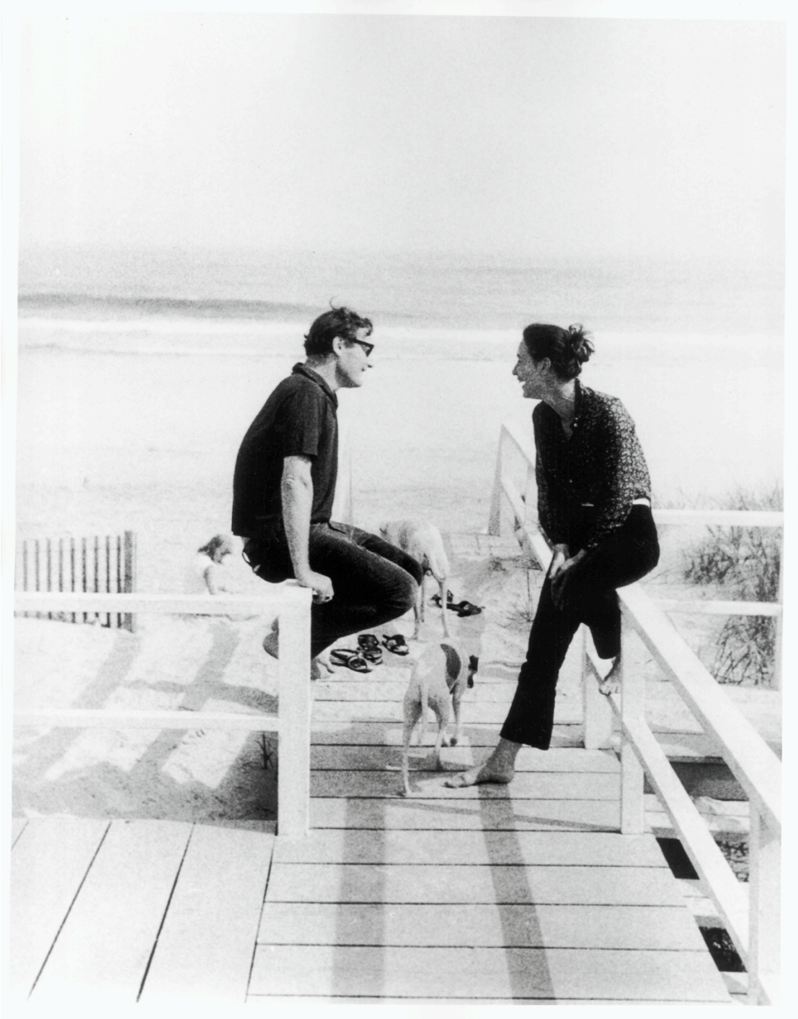
Kenward Elmslie and Jane Wilson, Westhampton, 1966